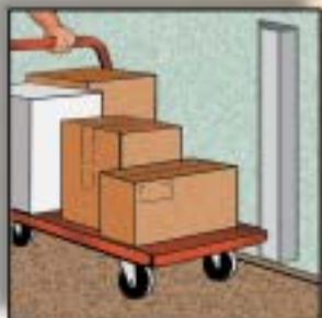
Tapered contour discourages shear-off from wheeled conveyances.