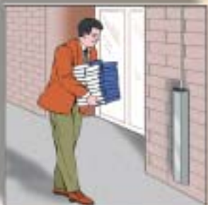
Free up parcel laden traffic with a mere bump!