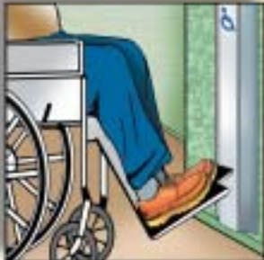
A pillar of improved accessibility for automatic doors